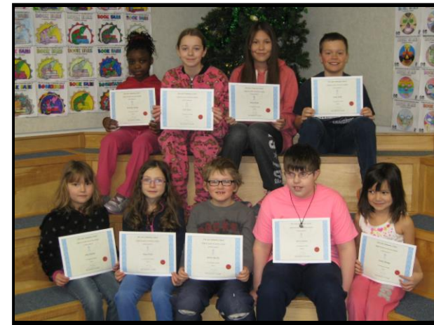
Student of the Week For having good work habits